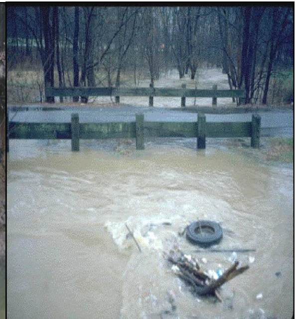
Increased flood peaks