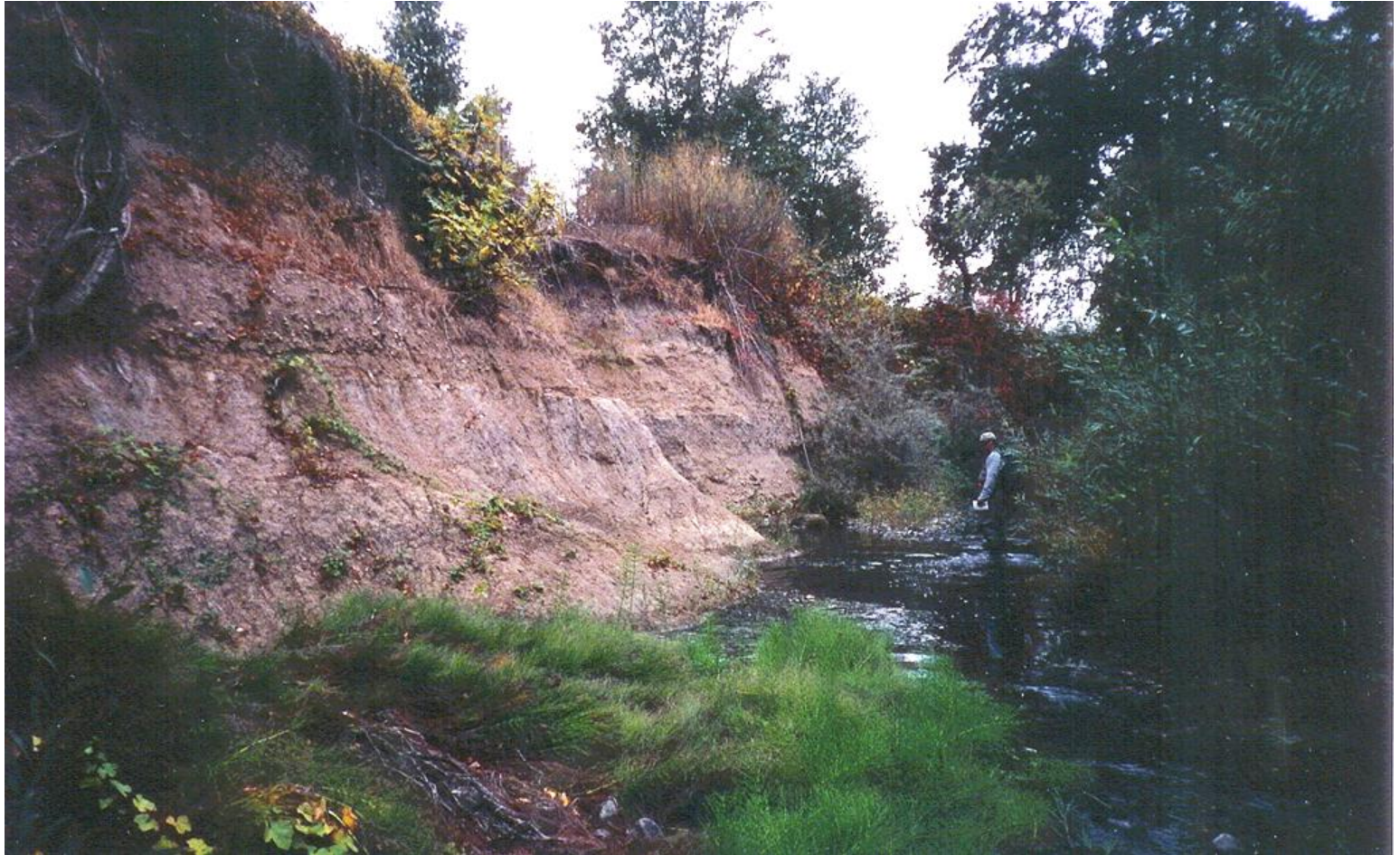
Napa River near Dunaweal Lane (Photo Credit: Martin Trso).

Channel Incision contributes lots of fine sediment and destroys salmon habitat