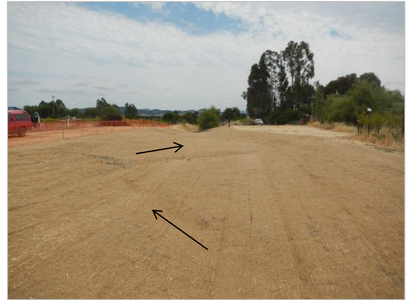
Post Implementation Photos.